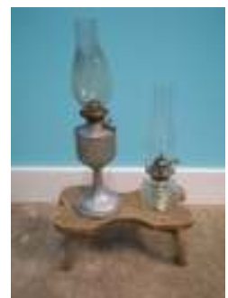
Handlan metal oil lantern

Brazle Auction & Realty 7168 US 160 Winfield, KS 67156 620.221.0701