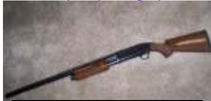
Browning 12 ga. pump, shoots 2 3/4" & 3" shells