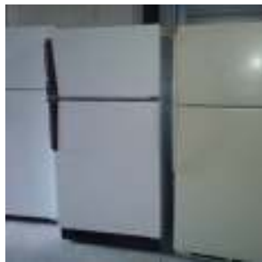
1 Frigidaire & 2 Amana refrigerators