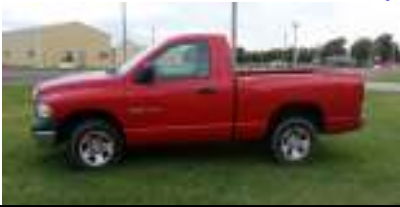
2009 Dodge 1500~5 spd, 115K, new clutch, cloth interior

Proceeds to benefit the "Water for Africa" project-Crossroads Community Church