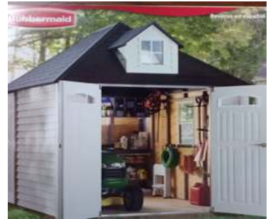
2~New Rubbermaid Frameworks Storage Sheds