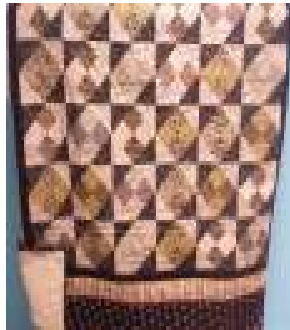
Amish hand stitched quilt 73"x66"