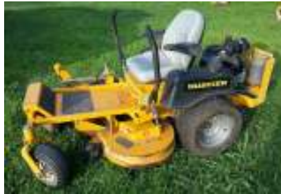
Hustler Mini-Z, 42" 19hp, 5 yrs old, exc.