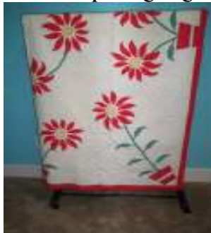
Vintage machine quilt 78"x94"

6 boxes Remington 12 ga. Shotgun shells*miniature doll collection*whiskey decanter collection*bed topper for '97-'98 Ford Ranger*Faberge Egg*Set of Pfaltzgraf Tea Rose China w/many accessory pieces*old games in original boxes*Zenith console stereo w/custom made marble top(nice)*Vintage bowling pin collectables*Heat Source Amish mantel heater*hand tools*German made compote w/lid*Gift baskets/packages/gift certificates from local businesses*many vintage items, household & furniture items*