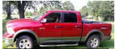
2009 Dodge 1500 Quad cab, 60K, 4.7L V-8, 4WD